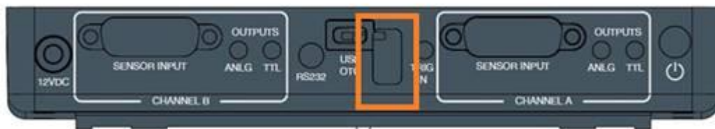
Figure 1 Upper panel of Centauri Meter with USB input highlighted