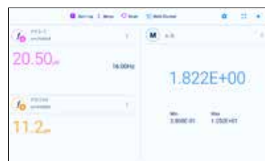
Two channels with a math comparison channel.