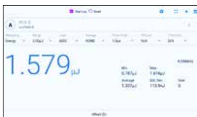
Display statistics of the present measurement session.