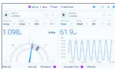
Two independent channels of measurement.