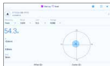
Power, Position, and Size measured with a BeamTrack sensor.