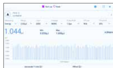
Pulse chart display of energy.