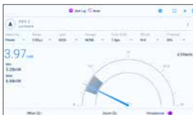
Analog needle display of power Persistence and min/max tracking.