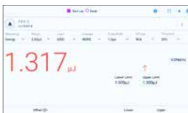
Pass/Fail screen. Excellent for QA purposes.