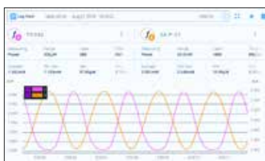
Two channels merging into one graph.