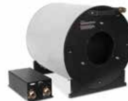
120K-W / 150K-W